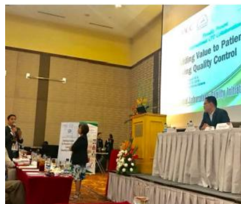
Q & A SESSION