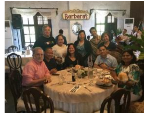
CULTURAL TOUR IN MANILA