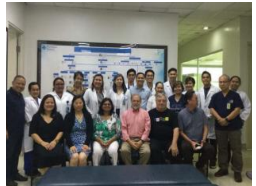
HOSPITAL LABORATORY VISITS