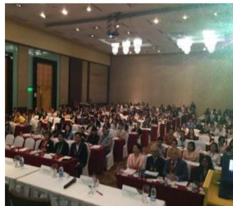
THE PARTICIPANTS OF APFCB-AACC WORKSHOP