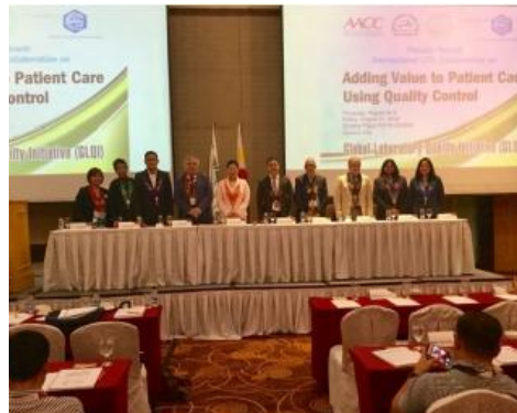
THE FACULTY OF APFCB-AACC WORKSHOP